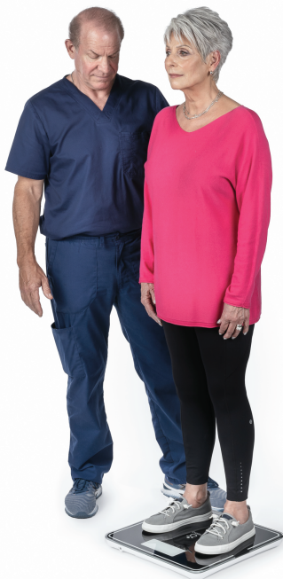
Figure 1. Testing with the Stability™ Pro scale